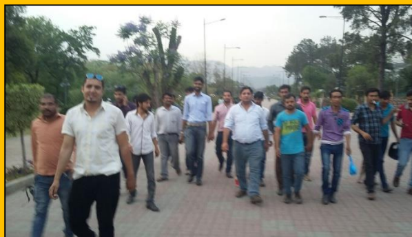
The Islamabad Shaheens!