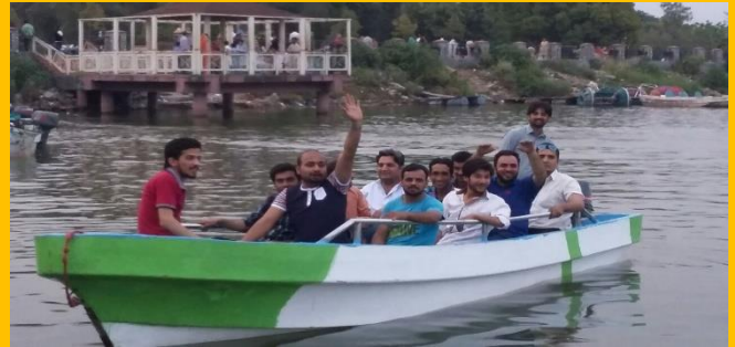
We may all have come in different boats but we are in the same boat now