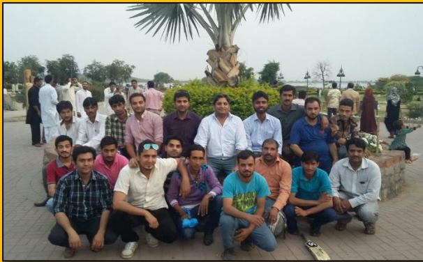
Team Cricket Match because competition is what we like!

“The man who removes a mountain begins by carrying away the small stones”