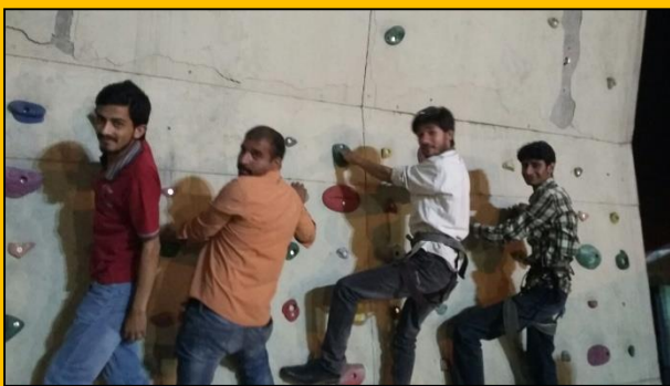
If you don't challenge yourself you will never realize what you can achieve