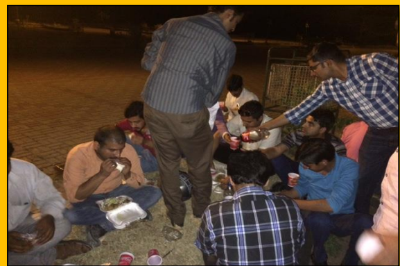
You learn a lot about someone when you share a meal together